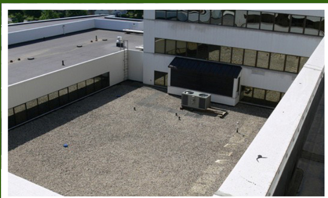
Pebble Beach 2010

RN Genesis Health Group, Davenport Surgical