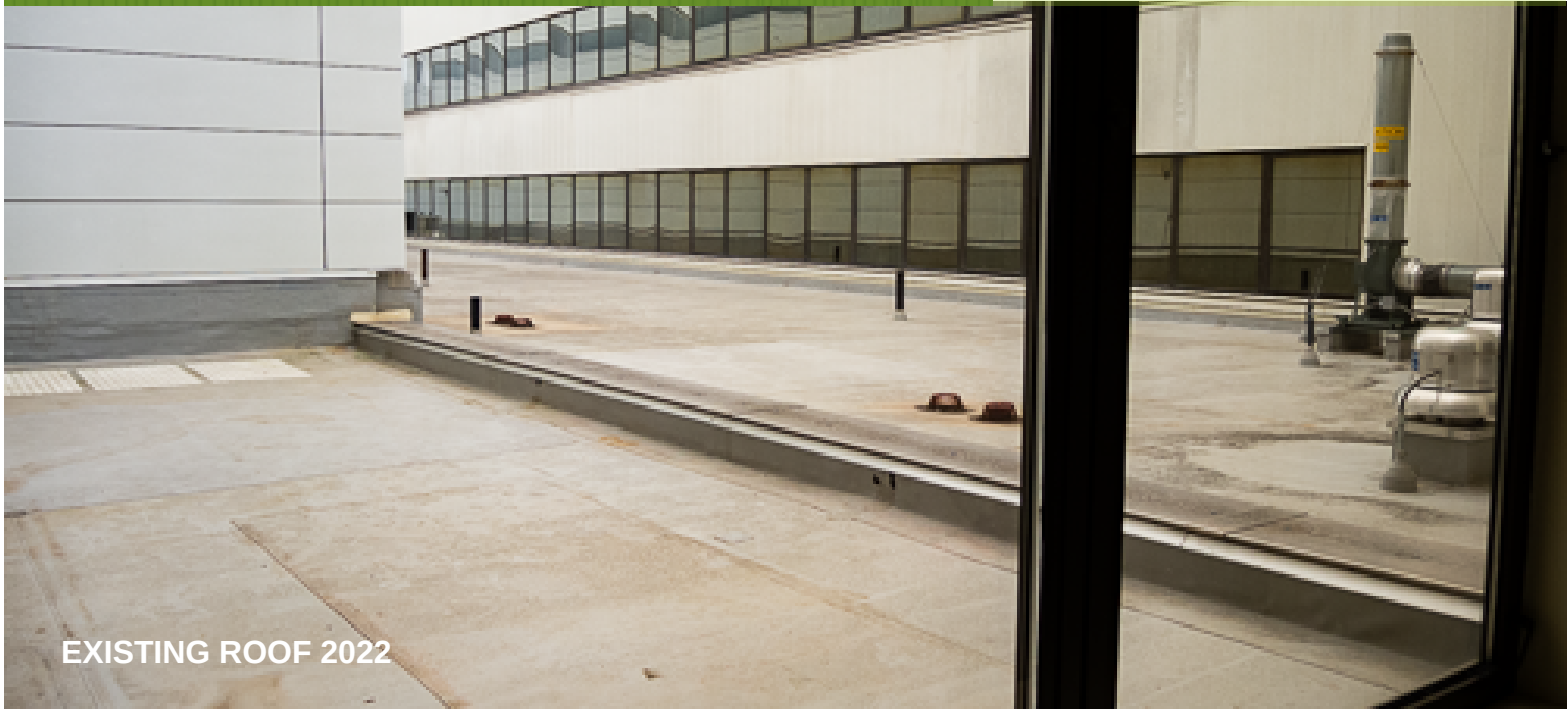
EXISTING ROOF 2022

Please help us achieve our $125,000 goal by making your tax-deductible gift to the Genesis Foundation for the Green Roof Project.